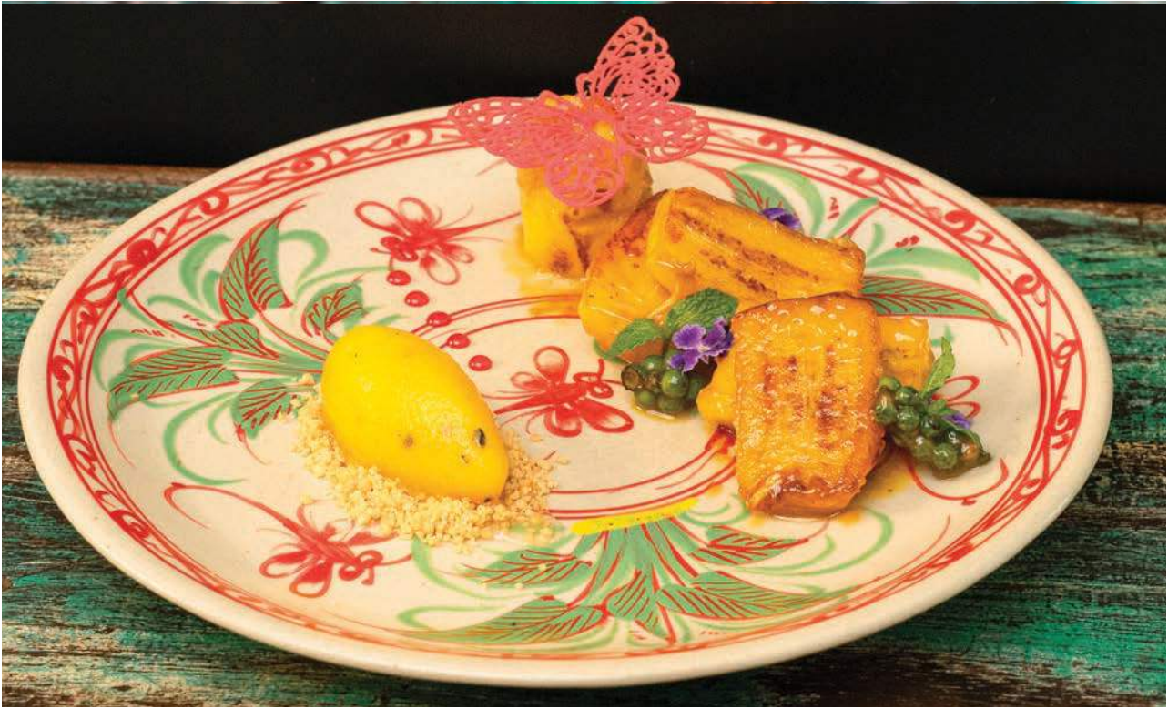
Banana Flambé and Ice Cream